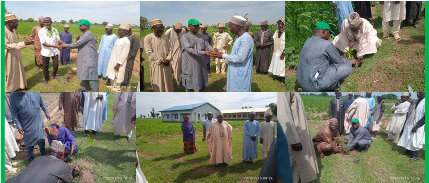
Week activities in pictures: The AGRA-NAERLS Kaduna Consortium Project. Secondary school Agroforestry Project (Neem Seedling Transplanting) at Government Secondary School Likoro.