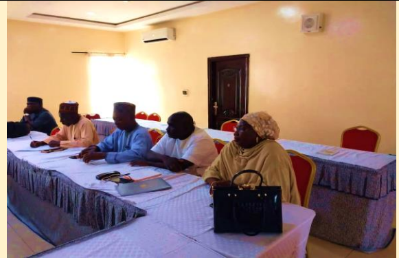
A Cross section: of the NAERLS Principal Officers during the award ceremony.