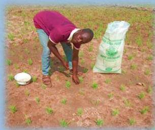
Anguwar Bako Ikara Community during first fertilizer 12/7/2023