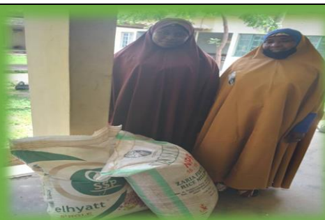
Week activities in pictures: CBAs from Ikara LGA received fertilizer for their mother demos under the AGRA-NAERLS Kaduna Consortium Project: